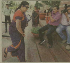
HRD Minister Smriti Irani at Parliament House.

"The Central government must invest money in creating infrastructure... Not buildings, roads and class rooms, but by bringing out books which have no religious tilt or involvement. No re-